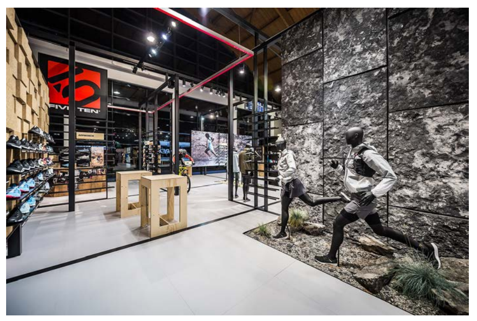
IMG_ 7018: A massive stone wall of 5 meters makes up the backdrop for the highlight staging Trail Running, complete with a real gravel bedding in front of it.