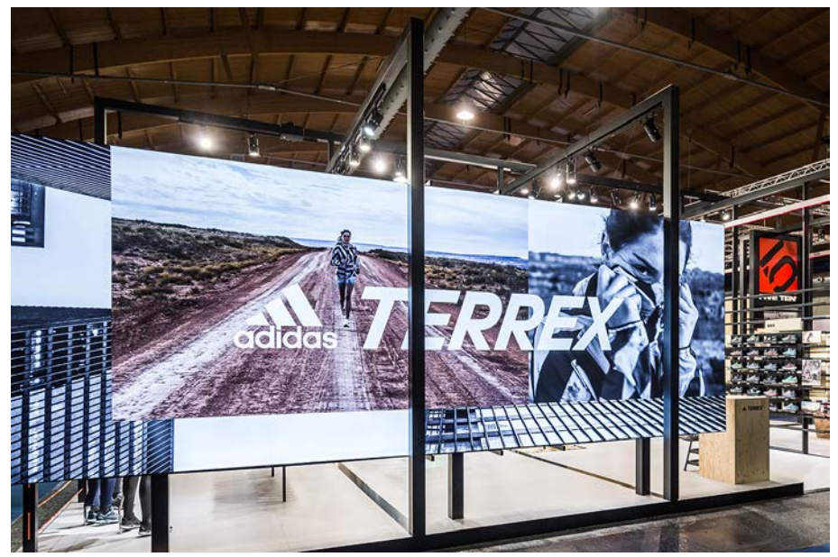
IMG_6440: Dart creates for adidas a brand experience which is striking in its authentic look and feel within a modular, black grid.