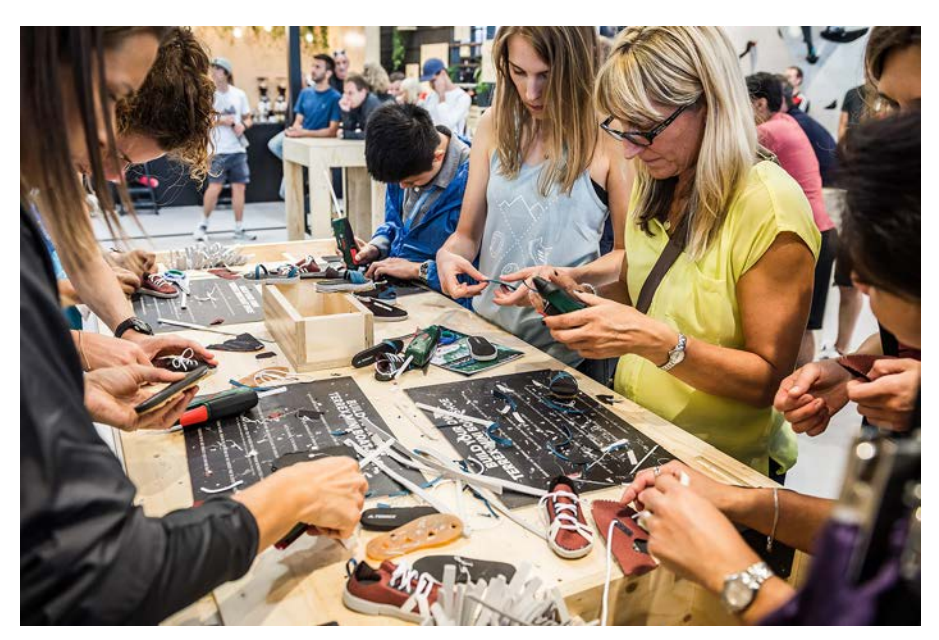
\rm IMG\_6220 : In the Maker Lab, a miniature of an adidas outdoor shoe can be handmade by visitors on-site.