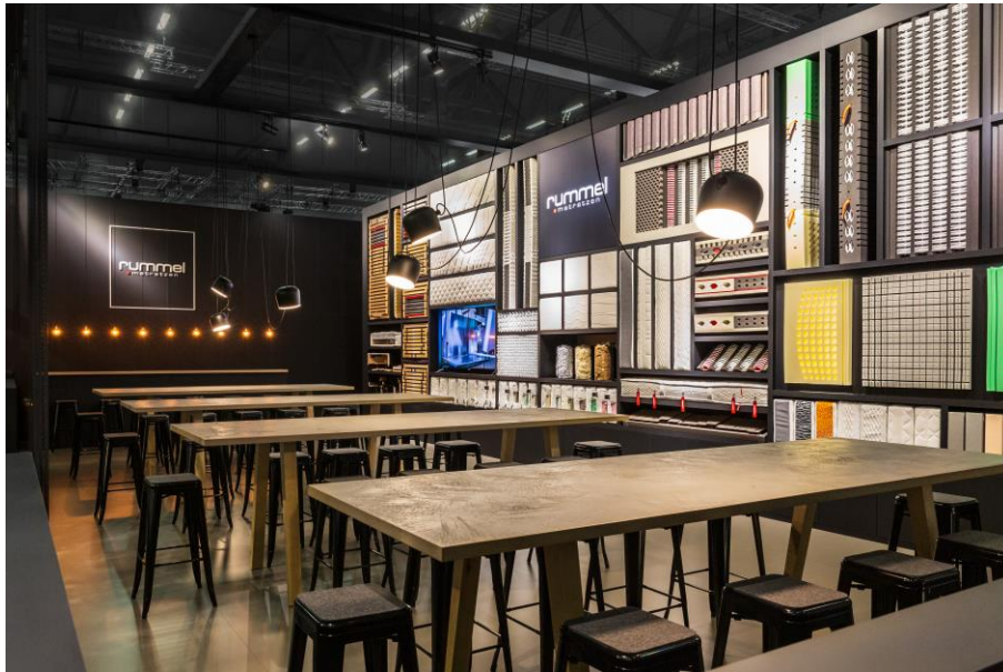
IMG_ 3: A large product sample library in conjunction with tables similar to workbenches, illustrates the crafts character of Rummel.