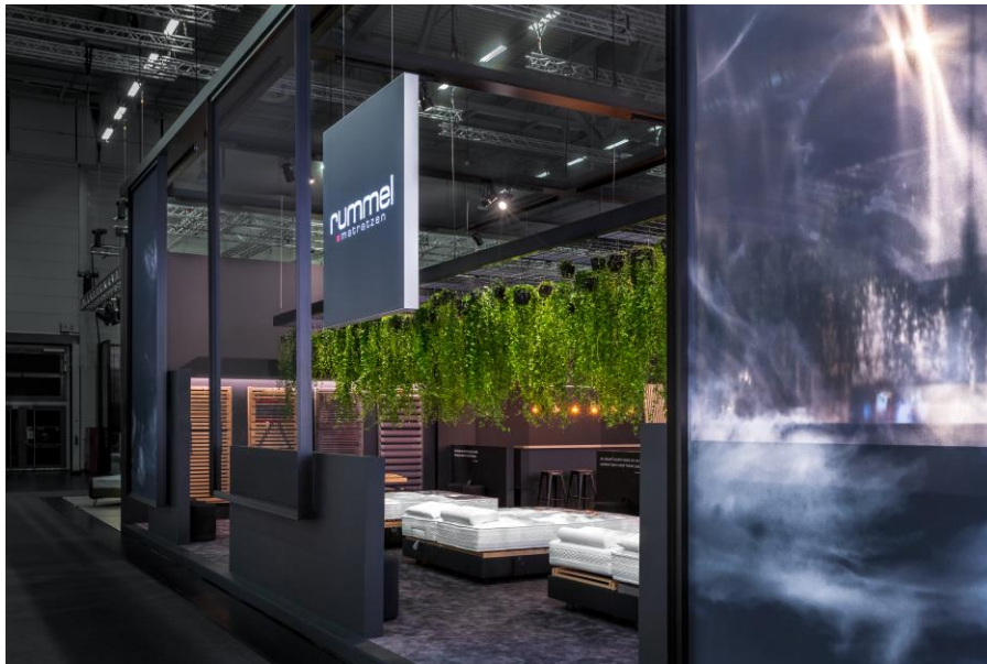
IMG_ 1: With dark colors Dart brings the night, for Rummel Matratzen, in the Cologne exhibition halls.